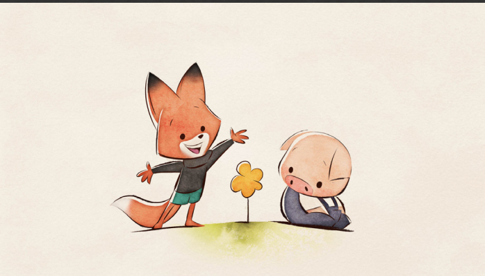
Pig: The Dam Keeper Poems © Tonko House Inc., 2017

Because working in an uncluttered space improves your concentration, TVPaint Animation 11 offers you a whole new interface called « Orage » : a darker background to focus better on your colours, new icons with a discreet design, the possibility to double and triple the interface on high-definition screens, and more. Everything has been made to make the use of TVPaint Animation enjoyable .