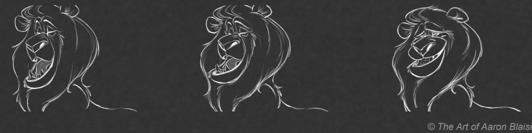
© The Art of Aaron Blais

Dual Core 2 GHz CPU • 2 GB RAM 10 GB free on your hard drive