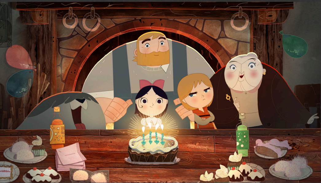
« The Song of the Sea » directed by Tomm Moore Cartoon Saloon, Melusine Productions, Superprod, The Big Farm, Norlum

Now stock your image references and your textures in a library made available within each project.